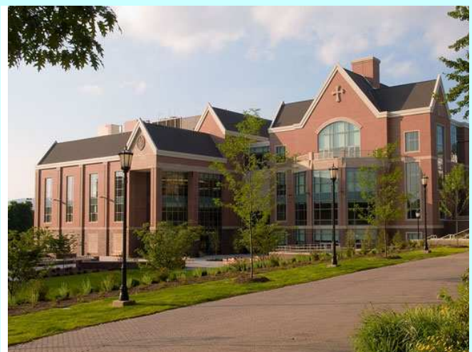
Patrick & Margaret DeNaples Center, UoS