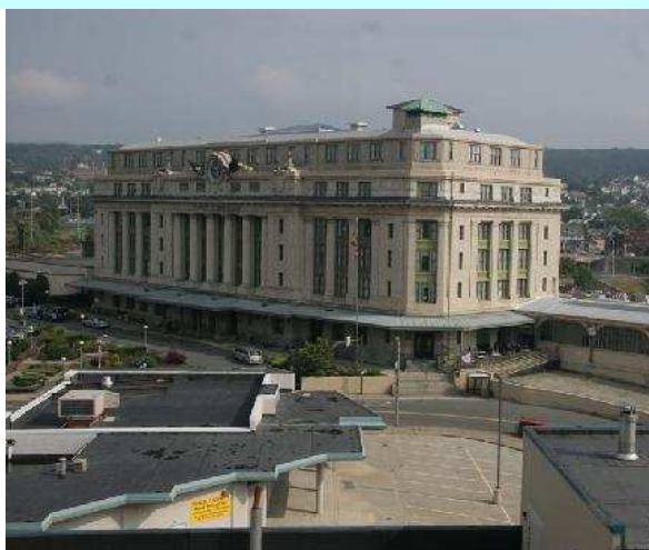
Scranton City View