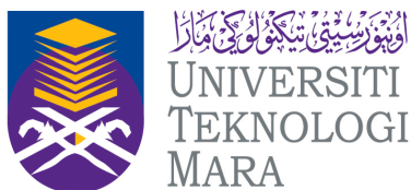
University Technology Mara, Malaysia www.uitm.edu.my