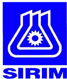
SIRIM Berhad, Malaysia www.sirim.my