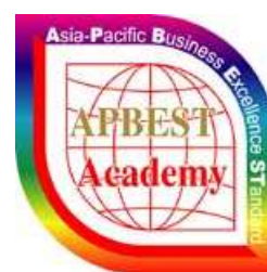
(Asia-Pacific Business Excellence Standard) APBEST Academy – HKSAR www.apbest.org